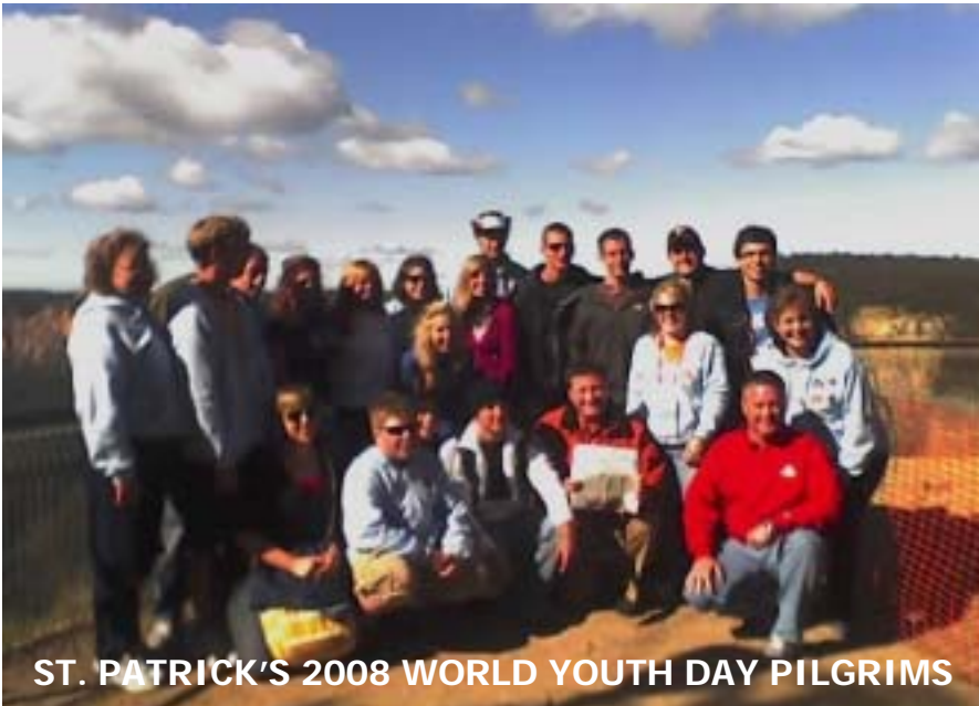
ST. PATRICK'S 2008 WORLD YOUTH DAY PILGRIMS